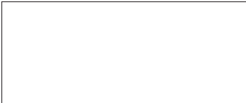
1/4 page (horizontal) - 4-1/2" wide x 1-7/8" high